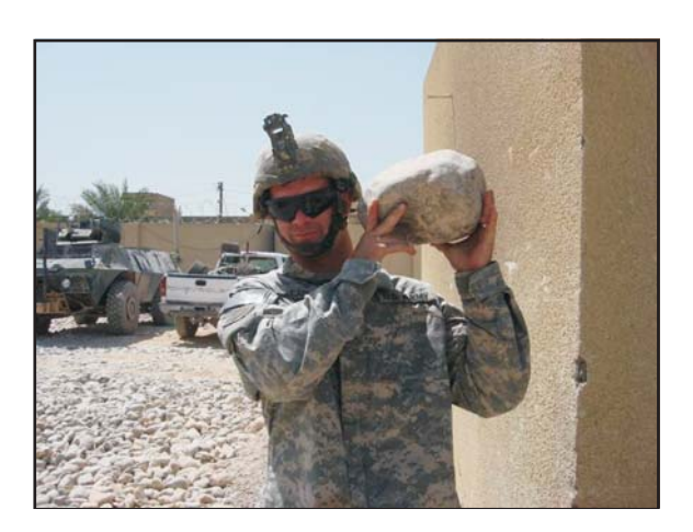
Figure 3-1. The consequences of a poorly-written PWS for a gravel parking area.